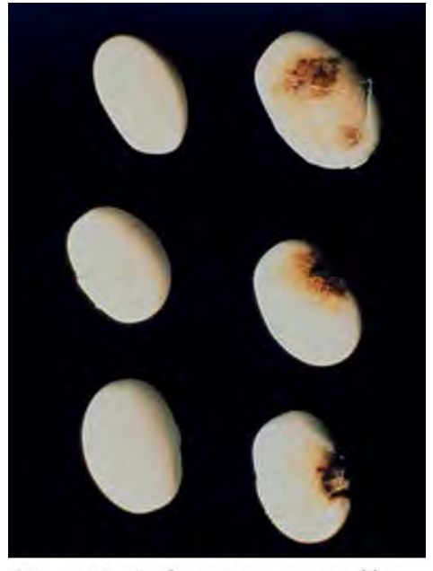
Figure 3. Anthracnose, caused by <u>Colletotrichum lindemuthianum</u> on bean seeds (right). Uninfected seeds (left).

Plant infection and conidial production are favored by temperatures of 55-79°F (13-26°C), with an optimum of 63°F (17°C). Relative humidity of greater than 92% (or free moisture) is required during all stages of conidium germination, infection, and subsequent sporulation. Moderate rainfalls at frequent intervals, particularly if accompanied by wind or splashing rain, are favorable conditions for local dissemination of conidia and development of epidemic.